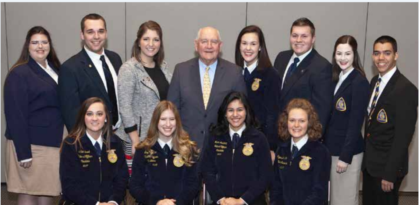
FFA National Officer Candidates, pictured with U.S. Secretary of Agriculture Sonny Perdue