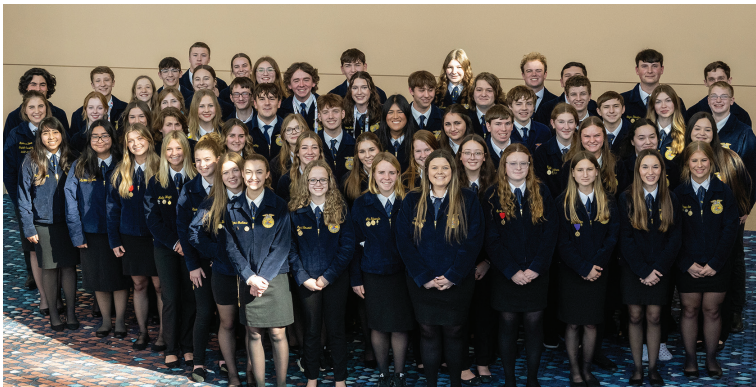
FFA students and advisors at the 2024 IPPE.

The following Food Science and Technology CDE teams were invited to attend IPPE: Big Walnut-DACC FFA, Ohio; Eustis-Farnam FFA, Nebraska; Gardiner FFA, Montana; Lincoln FFA, Arkansas; Louisburg FFA, Kansas; Palmyra FFA, Missouri; South Prairie FFA, Weimar FFA; and West Orange FFA, Florida.